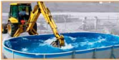
A vigorous backhoe test is performed prior to the launch of each new pool.

The Engineering design of the Channel-Lok II buttress system has been developed to require fewer buttresses without compromising its strength and reliability. Along with Beaches' unique structural system and fewer buttresses, the Channel-Lok II buttress system will be appreciated for its good looks and ease of installation. This new buttress system can be installed on a flat concrete surface. There is no excavation or digging required, only a flat compacted level surface.