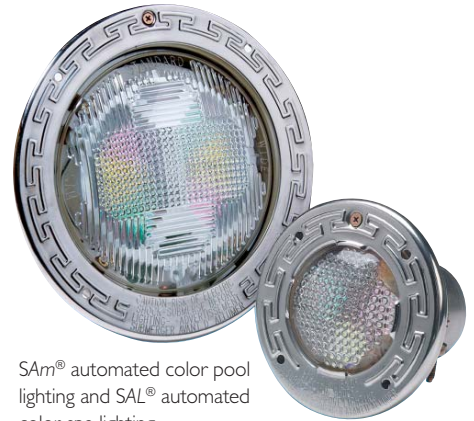
SAm® automated color pool lighting and SAL® automated color spa lighting.