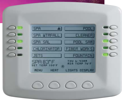
IntelliTouch® pool and spa control system

One of the most dramatic and enjoyable possibilities with FIBERworks® is the automation of your system and other Pentair lighting products with the IntelliTouch® control system: